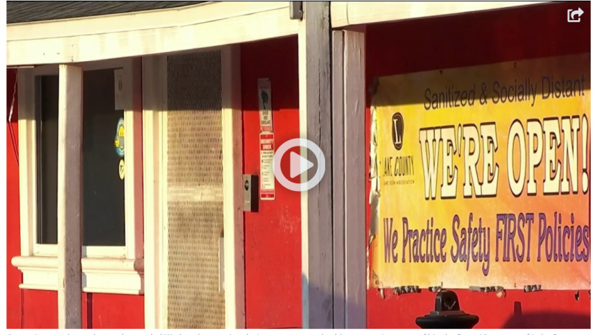
A security guard was shot and wounded Wednesday evening during an attempted robbery at an internet café in the Dona Vista area of Lake County, according to sheriff's officials.

Victim airlifted to hospital after Dona Vista shooting